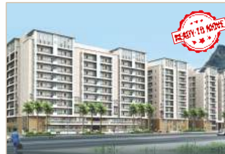
NIRALA HILLS AJMER, RAJASTHAN