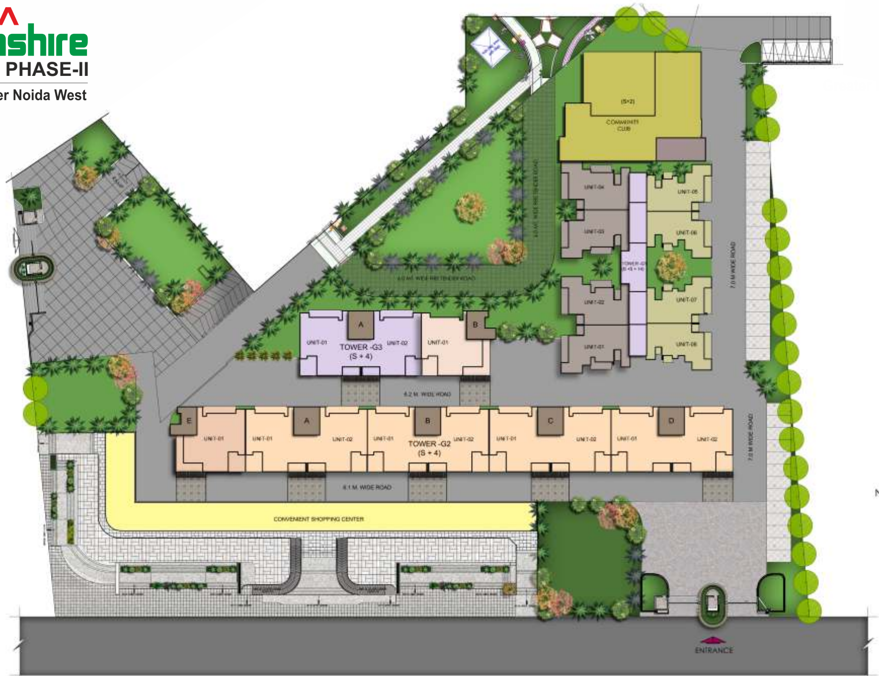
Site Plan-Nirala Greenshires Phase-II