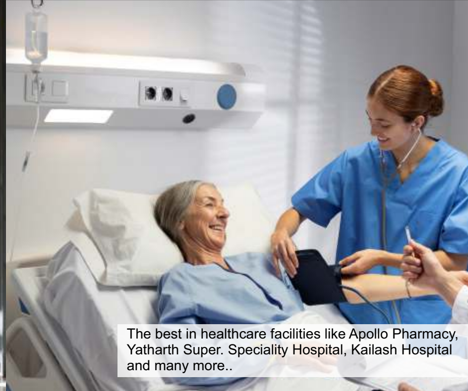
The best in healthcare facilities like Apollo Pharmacy, Yatharth Super. Speciality Hospital, Kailash Hospital and many more..