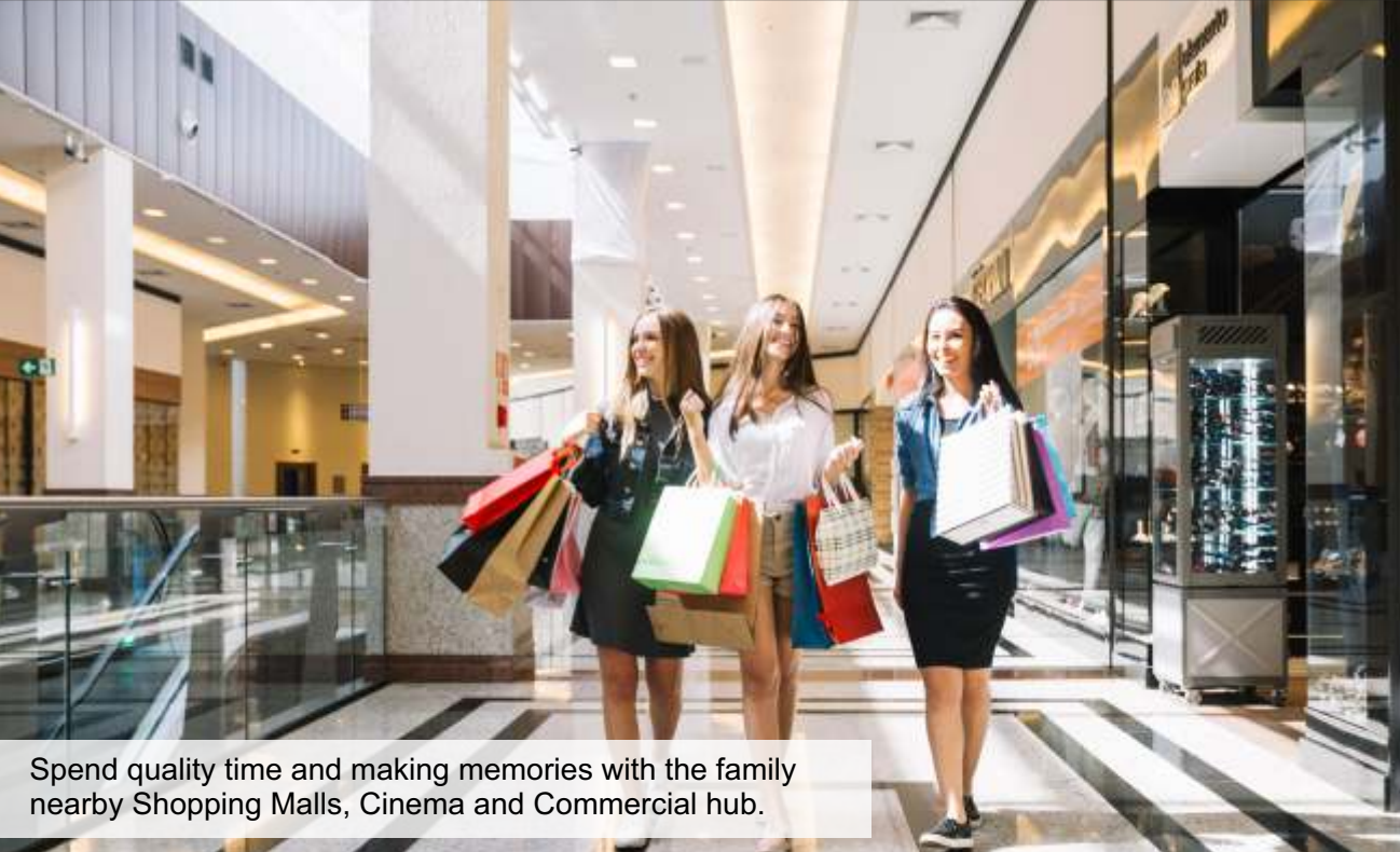
Spend quality time and making memories with the family nearby Shopping Malls, Cinema and Commercial hub.