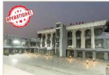
NIRALA ASPIRE PLAZA SEC. 16 - GREATER NOIDA (W), UP