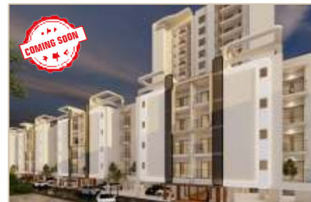
NIRALA GREENSHORE PH-II SEC. 2 - GREATER NOIDA (W), UP