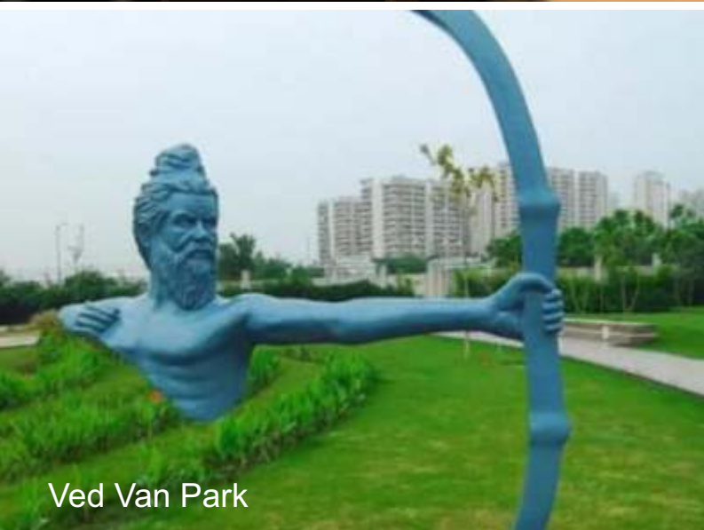
Ved Van Park