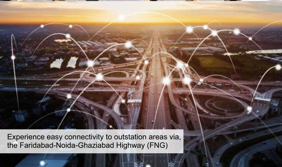
Experience easy connectivity to outstation areas via, the Faridabad-Noida-Ghaziabad Highway (FNG)