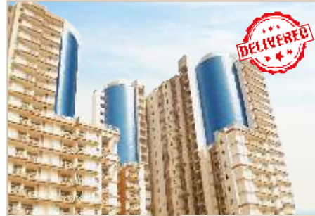
NIRALA EDEN PARK SEC. 50 - NOIDA, UP