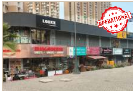
NIRALA GREENSHORE MART SEC. 2 - GREATER NOIDA (W), UP