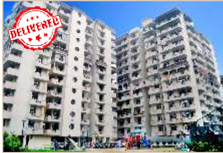
NIRALA EDEN PARK INDIRAPURAM - GHAZIABAD, UP