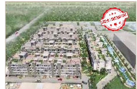
ASPIRE NIRALA GOLD PH-II SEC. 16 - GREATER NOIDA (W), UP