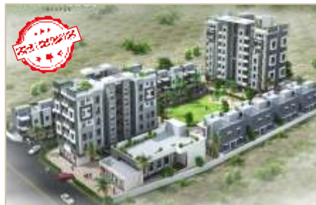
NIRALA GREENWOODS NAGPUR, MAHARASHTRA