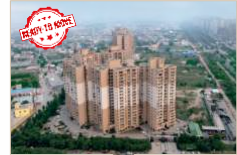
NIRALA GREENSHORE SEC. 2 - GREATER NOIDA (W), UP