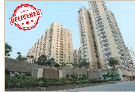
NIRALA ASPIRE SEC.16 - GREATER NOIDA (W), UP